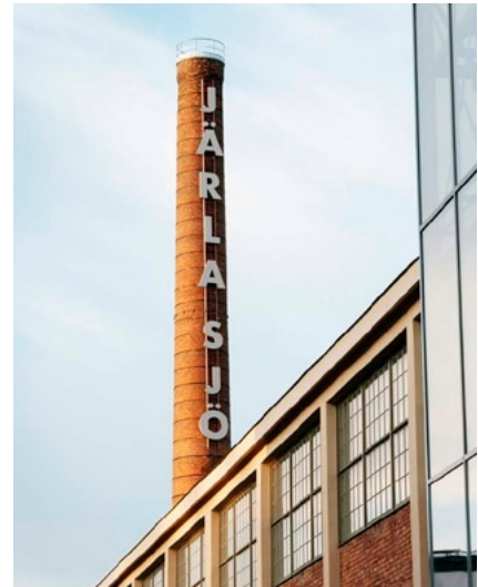
STOCKHOLM MODECENTER IN NACKA

Founded in 1991. Moved from Liljeholmen to Järsla Sjö one year ago. The old, traditional factory site opens its doors to a fully booked fashion week. In addition to the 182 permanent tenants representing almost 500 brands, some 30 guest exhibitors will be on site at Gustaf de Laval's Torg and Garverigränd 9.