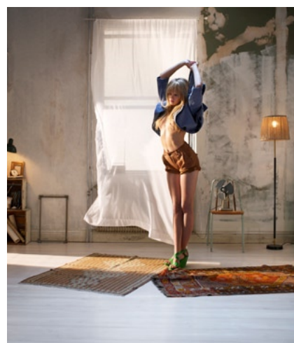
DAGMAR A/W 08-09