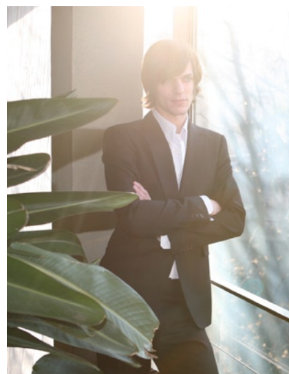
BJÖRN BORG A/W 08-09