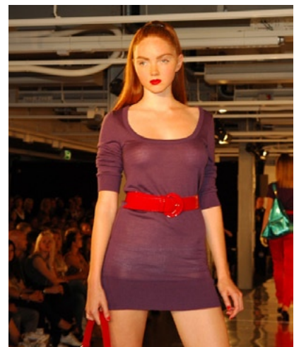
LILY COLE ON THE CATWALK AT MODECENTER IN AUGUST 2007