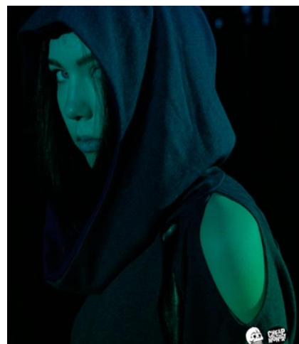
CHEAP MONDAY A/W 08-09

Founded in 1993 with collections for women, the company added menswear in 1998. New head designer starting 2008 is Nina Bogstedt. The coming season for womenswear is influenced by early 1970s, with singer Nico of the US rock band Velvet Underground as the prominent figure,