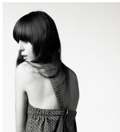
HOPE A/W 08-09