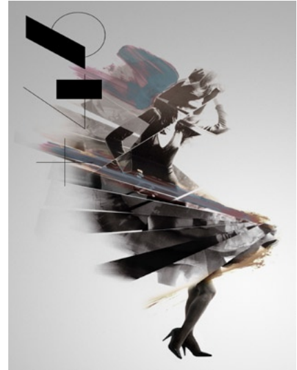
+46, TRADE FAIR AT KUNGSHOLMEN

Rookies & Players is run by the Swedish Fashion Council since 2005. The ambition is to be a fashion arena that helps smaller fashion companies establish themselves on the market through various projects, networks and trading sites in conjunction with Fashion Week. Arranged for the eleventh time. Rookies & Players participants have been selected by