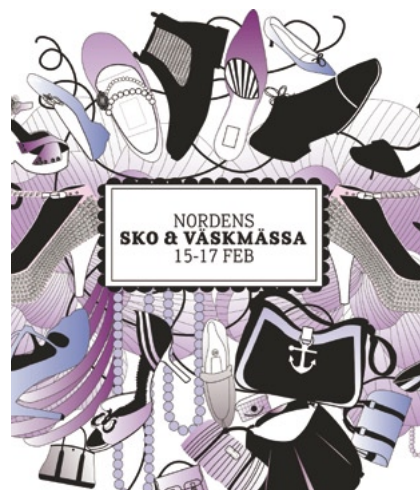
INVITATION TO NORDIC SHOE & BAG FAIR AT STOCKHOLM INT. FAIRS IN ÄLVSJÖ

👁 Fashion show Thursday 31 Jan. www.bjornborgwhite.com