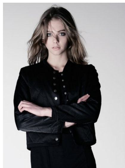
LUDIC A/W 08-09