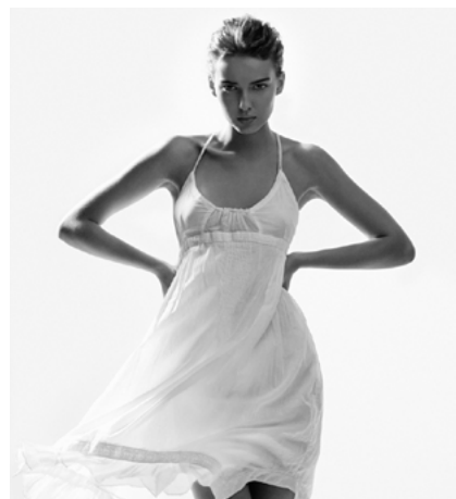
HUNKYDORY S/S 2008